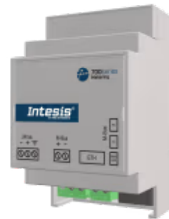
M-Bus Meters to Modbus TCP server - Up to 20 meters

Enable fast and cost-effective integration of M-Bus meters into Modbus TCP networks. Built-in M-Bus level converter and auto-discovery features reduce setup time and simplify commissioning.