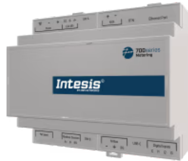
M-Bus, Modbus, and Digital Pulses to Modbus - Up to 10 meters

Enable fast and cost-effective integration of Modbus devices and meters, M-Bus meters, and pulse meters into Modbus TCP and/or RTU systems. Built-in M-Bus level converter and auto-discovery features reduce setup time and simplify commissioning.