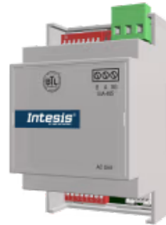
Mitsubishi Electric Air-to-Water to Modbus RTU - 1 AW unit

This gateway allows full bidirectional communication between Mitsubishi Electric Air-to-Water heat pumps and Modbus RTU networks.