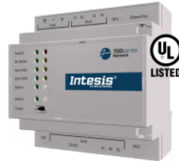
DALI to Modbus TCP - 2 DALI channels

Integrate any DALI/DALI-2 driver and DALI-2 light sensor or occupancy sensor with a Modbus BMS or any Modbus TCP controller. This integration aims to make DALI devices and their data and resources accessible from a Modbus-based control system or device as if they were a part of the Modbus system and vice versa.