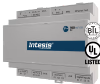
Midea to BACnet/IP & MS/TP - Up to 16 Indoor Units

The Midea application has been specially designed to allow bidirectional control and monitoring of Midea Commercial and VRF systems from a BMS, SCADA, PLC, or any other device working as a BACnet/IP server or a BACnet MS/TP client. The solution allows the integration of up to 16 indoor units from a single interface.