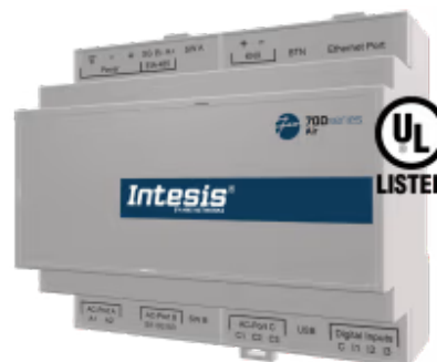
Daikin to Modbus TCP/RTU - Up to 16 Indoor Units

The Daikin application has been specially designed to allow bidirectional control and monitoring of Daikin HVAC (DIII-NET) from a BMS, SCADA, PLC, or any other device working as a Modbus client. The solution allows the integration of up to 16 indoor units from a single interface.