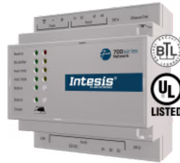
DALI to BACnet/IP- 2 DALI channels

Integrate any DALI/DALI-2 driver and DALI-2 light or occupancy sensor with a BACnet/IP BMS or controller. This integration aims to make DALI devices and their data and resources accessible from a BACnet-based control system or device as if they were a part of the BACnet system and vice versa.