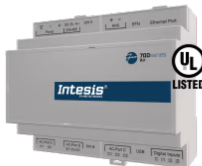
Mitsubishi Electric to KNX - Up to 100 groups

The Mitsubishi Electric application has been specially designed to allow bidirectional control and monitoring of Mitsubishi Electric City Multi systems from a KNX installation. The solution allows the integration of up to 100 groups from a single interface.