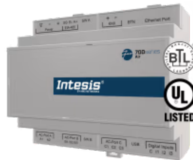
Panasonic to BACnet/IP & MS/TP - Up to 128 Indoor Units

The Panasonic application has been specially designed to allow bidirectional control and monitoring of Panasonic ECOi, PACi, ECOg / PAC, VRF systems from a BMS, SCADA, PLC, or any other device working as a BACnet/IP server or a BACnet MS/TP client. The solution allows the integration of up to 128 indoor units from a single interface.