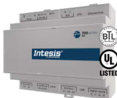
Panasonic to BACnet/IP & MS/TP - Up to 16 Indoor Units

The Panasonic application has been specially designed to allow bidirectional control and monitoring of Panasonic ECOi, PACi, ECOg / PAC, VRF systems from a BMS, SCADA, PLC, or any other device working as a BACnet/IP server or a BACnet MS/TP client. The solution allows the integration of up to 16 indoor units from a single interface.