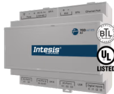
Samsung to BACnet/IP & MS/TP - Up to 16 Indoor Units

The Samsung application has been specially designed to allow bidirectional control and monitoring of Samsung NASA VRF systems from a BMS, SCADA, PLC, or any other device working as a BACnet/IP server or a BACnet MS/TP client. The solution allows the integration of up to 16 indoor units from a single interface.