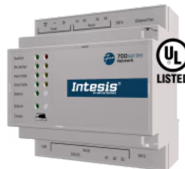
KNX to ASCII IP & ASCII Serial - 250 points

Integrate any KNX device or installation with an ASCII BMS or any ASCII IP or ASCII serial controller. This integration aims to make KNX communication objects and resources accessible from an ASCII-based control system or device as if they were a part of the ASCII system and vice versa.