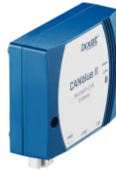
CAN Bluetooth bridge and PC interface with internal antenna

The Ixxat CANblue II is a versatile and cost-effective Bluetooth module for CAN systems that is equipped with an internal antenna. It offers three operation modes: PC interface, bridge, and gateway, making it suitable for various application areas. It is ideal for mobile configuration, analysis, and conveniently bridging CAN networks via Bluetooth.