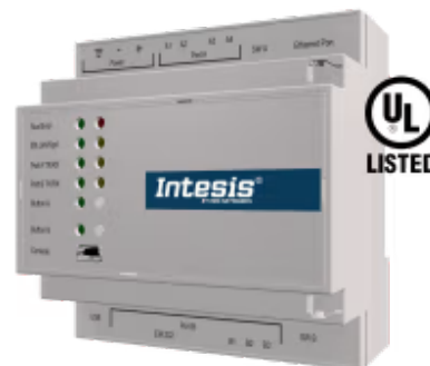
M-BUS to Modbus TCP & RTU - 10 devices

Integrate any M-Bus device with a Modbus BMS or any Modbus TCP or Modbus RTU controller. This integration aims to make M-Bus devices, their registers, and resources accessible from a Modbus-based control system or device as if they were a part of the Modbus system and vice versa.