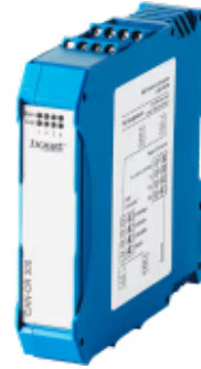
CAN/CAN FD repeater with four channels and termination resistor

The Ixxat CAN-CR300 repeater with four CAN/CAN FD interfaces improves the CAN bus load capacity, establishes a physical coupling of bus systems and offers galvanic isolation. It provides the flexibility to optimize network structures and liberates them from CAN bus structure constraints for optimized operation. With integrated termination resistors.