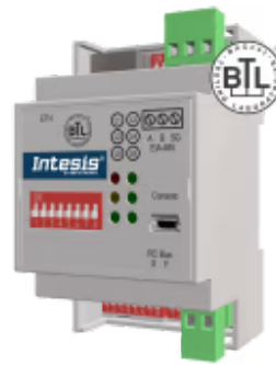
Mitsubishi Heavy Industries to BACnet/IP & MS/TP - 1 indoor unit

The Mitsubishi Heavy Industries-BACnet interface allows full bidirectional communication between MHI FD and VRF air conditioner units and BACnet/IP or MS/TP systems. It enables BACnet communication via polling or subscription requests (COV), making the indoor unit available via independent BACnet objects. A wired remote controller can also be used.