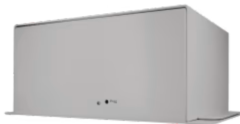
Toshiba to KNX - 16 indoor units

The Toshiba interface has been specially designed to allow bidirectional control and monitoring of Toshiba VRF systems from a KNX installation. The gateway is directly connected to the outdoor unit's communication bus and enables control of all the indoor units connected to the system.