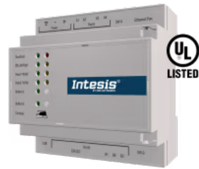
LG to KNX - 16 indoor units

The LG interface has been specially designed to allow bidirectional control and monitoring of LG VRF systems from a KNX installation. This enables the control of all the indoor units connected to the system, the monitoring of the main AC functions, and access to some internal variables of the outdoor units.