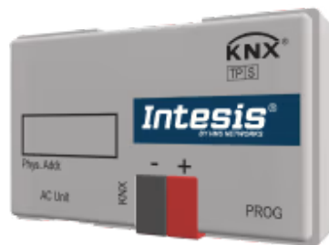
Mitsubishi Electric Domestic to KNX - 1 indoor unit

The Mitsubishi Electric-KNX interface allows full bidirectional communication between Mitsubishi Electric domestic, Mr. Slim, and City Multi air conditioner units and KNX installations. It connects directly to the indoor unit and delivers complete interoperability with KNX.