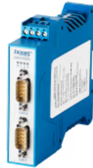
CAN repeater with backbone bus

The Ixxat CAN-CR200 repeater with two CAN interfaces and one CAN backbone interface improves the CAN bus load capacity, establishes a physical coupling of bus systems and offers galvanic isolation. Multiple repeaters can be lined up and connected easily via the integrated DINrail bus to create various topologies and optimize network structures.