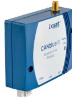
CAN Bluetooth bridge and PC interface (external antenna)

The Ixxat CANblue II is a versatile and cost-effective Bluetooth module for CAN systems that can be used with an external antenna. It offers three operation modes: PC interface, bridge, and gateway, making it suitable for various application areas. It is ideal for mobile configuration, analysis, and conveniently bridging CAN networks via Bluetooth.