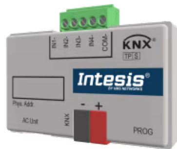
Daikin to KNX - 1 indoor unit

The Daikin-KNX interface allows full bidirectional communication between Daikin AC Domestic units and KNX installations. It has four potential-free binary inputs available to integrate and configure external devices (window contacts or presence detectors) to improve energy efficiency.