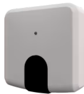
Universal IR Air Conditioner to KNX Interface - 1 indoor unit

The Universal InfraRed (IR)-KNX device allows total integration of any air conditioner unit (with an IR receiver) into KNX systems. Thanks to the device's capability of emitting and receiving infrared signals, the AC unit can be controlled simultaneously by KNX and the IR remote. Two binary inputs are available (for presence sensor/window contact).