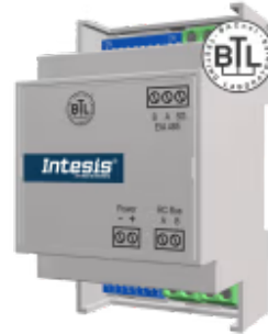
Toshiba to BACnet MS/TP - 1 indoor unit

The Toshiba-BACnet interface allows full bidirectional communication between Toshiba VRF and Digital air conditioner units and BACnet MS/TP networks. It enables BACnet communication via polling or subscription requests (COV), making the indoor unit available through independent BACnet objects. A wired remote controller can also be connected.