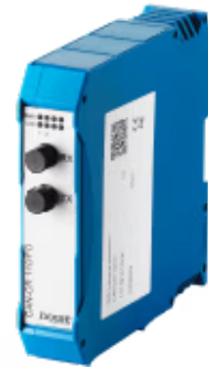
CAN/CAN FD repeater with fiber optics and termination resistor

The Ixxat CAN-CR110/FO repeater with two CAN/CAN FD interfaces, one of which is a Fiber Optic interface, enables the conversion of CAN signals from copper wire to fiber optics. It enhances connectivity in high-electromagnetic interference zones and provides the flexibility to optimize network structures. With integrated termination resistors.