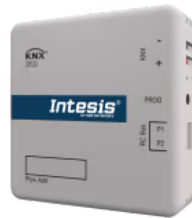
Daikin to KNX - 1 indoor unit

The Daikin-KNX interface allows full bidirectional communication between Daikin VRV and Sky systems and KNX installations. It connects directly to the indoor unit and delivers complete interoperability with KNX.