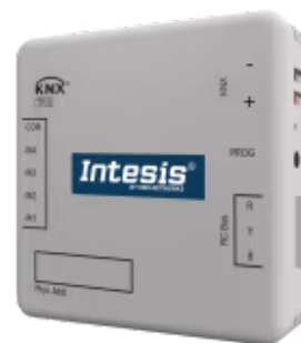
LG to KNX - 1 indoor unit

The LG-KNX interface allows full bidirectional communication between LG VRF systems and KNX installations. It has four potential-free binary inputs to integrate external devices (such as window contacts or presence detectors), with the corresponding internal functions available to help improve energy efficiency.