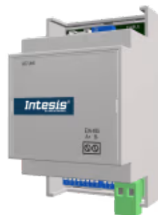
Mitsubishi Electric Domestic to Modbus - 1 indoor unit

The Mitsubishi Electric-Modbus interface allows full bidirectional communication between Mitsubishi Electric Domestic, Mr. Slim, and City Multi air conditioner units and Modbus RTU (RS-485) networks. The interface acts as a server device for the installation, accessing all signals from the air conditioner unit.