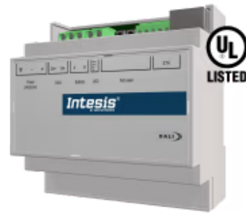
DALI-2 to Modbus TCP - 1 DALI channel

Integrate any DALI/DALI-2 driver and DALI-2 light sensor or occupancy sensor with a Modbus BMS or any Modbus TCP controller. This integration aims to make DALI devices and their data and resources accessible from a Modbus-based control system or device as if they were a part of the Modbus system and viceversa.