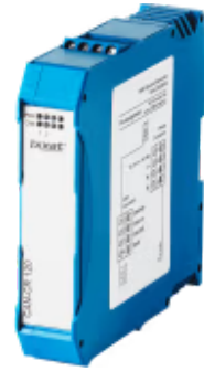
CAN/CAN FD repeater with 3 kV galvanic isolation and termination resistor

The Ixxat CAN-CR120/HV repeater with two CAN/CAN FD interfaces provides a galvanic isolation up to 3 kV for enhanced protection of network segments. It improves the CAN bus load capacity, establishes a physical coupling of bus systems and provides the flexibility to optimize network structures. With integrated termination resistors.