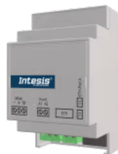
M-BUS to Modbus TCP - 50 devices

Integrate any M-Bus device with a Modbus TCP BMS or controller. This integration aims to make M-Bus devices, their registers, and resources accessible from a Modbus-based control system or device as if they were a part of the Modbus system and vice versa.