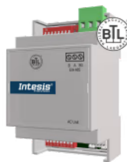
Daikin to BACnet MS/TP - 1 indoor unit

The Daikin-BACnet interface allows full bidirectional communication between Daikin Domestic air conditioner units and BACnet MS/TP networks. The interface enables BACnet communication via polling or subscription requests (COV), making the indoor unit available through independent BACnet objects.