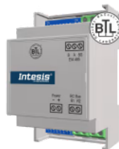
Panasonic to BACnet MS/TP - 1 indoor unit

The Panasonic-BACnet interface allows full bidirectional communication between Panasonic ECOi and PACi air conditioner units and BACnet MS/TP networks. It enables BACnet communication via polling or subscription requests (COV), making the indoor unit available through independent BACnet objects. A wired remote controller can also be connected.