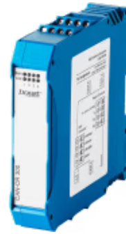
CAN/CAN FD repeater with four channels

The Ixxat CAN-CR300 repeater with four CAN/CAN FD interfaces improves the CAN bus load capacity, establishes a physical coupling of bus systems and offers galvanic isolation. It provides the flexibility to optimize network structures and liberates them from CAN bus structure constraints for optimized operation.