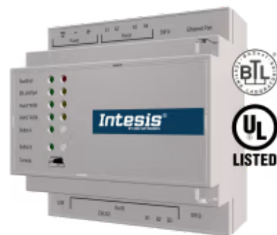
LonWorks TP/FT-10 to BACnet/IP & MS/TP - 3000 points

Integrate any LON device or installation with a BACnet BMS or any BACnet/IP or BACnet MS/TP controller. This integration aims to make LON devices, their network variables (SNVT), and resources accessible from a BACnet-based control system or device as if they were a part of the BACnet system and vice versa.