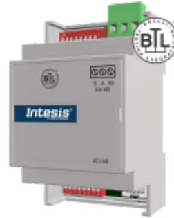
Mitsubishi Electric Domestic to BACnet MS/TP - 1 indoor unit

The Mitsubishi Electric-BACnet interface allows full bidirectional communication between Mitsubishi Electric domestic, Mr. Slim, and City Multi air conditioner units and BACnet MS/TP networks. The interface enables BACnet communication via polling or subscription requests (COV), making the indoor unit available through independent BACnet objects.