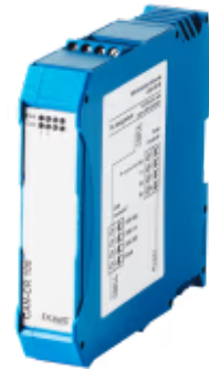
CAN/CAN FD repeater with screw terminals and termination resistor

The Ixxat CAN-CR100 repeater with two CAN/CAN FD interfaces improves the CAN bus load capacity, establishes a physical coupling of bus systems and offers galvanic isolation. It provides the flexibility to optimize network structures and liberates them from CAN bus structure constraints for optimized operation. With integrated termination resistors.