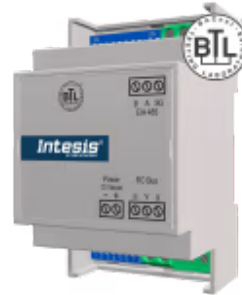
Midea to BACnet MS/TP - 1 indoor unit

The Midea-BACnet interface allows full bidirectional communication between Midea Commercial and VRF units and BACnet MS/TP networks. The interface enables BACnet communication via polling or subscription requests (COV), making the indoor unit available through independent BACnet objects.