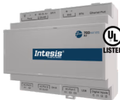
Fujitsu to Modbus TCP/RTU - Up to 16 Indoor Units

The Fujitsu application has been specially designed to allow bidirectional control and monitoring of Fujitsu VRF systems from a BMS, SCADA, PLC, or any other device working as a Modbus client. The solution allows the integration of up to 16 indoor units from a single interface.