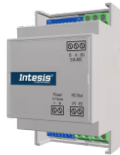
Daikin Air-to-Water to Modbus RTU - 1 AW unit

The Daikin-Modbus gateway allows full bidirectional communication between Daikin Altherma Air-to-Water heat pumps and Modbus RTU (RS-485) networks.