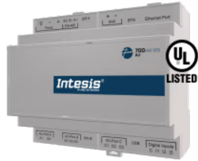
Midea to Home Automation - Up to 16 Indoor Units

The Midea application has been specially designed to allow bidirectional control and monitoring of Midea Commercial and VRF systems from a Home Automation system. The solution allows the integration of up to 16 indoor units from a single interface.