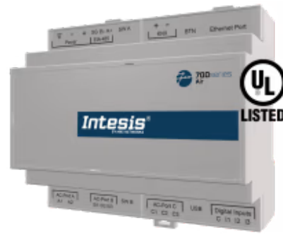
Mitsubishi Electric City to Home Automation - Up to 50 groups

The Mitsubishi Electric application has been specially designed to allow bidirectional control and monitoring of Mitsubishi Electric City Multi systems from a Home Automation system. The solution allows the integration of up to 50 groups from a single interface.