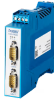
CAN repeater with 4 kV DC/3.5 kV AC galvanic isolation

The Ixxat CAN-CR220 repeater with two CAN interfaces provides a galvanic isolation up to 4 kV DC/3.5 kV AC for 1 second, enhancing the protection of network segments. It improves the CAN bus load capacity, establishes a physical coupling of bus systems and provides the flexibility to optimize network structures. The CAN-CR220 meets DIN/EN 50178 standards.