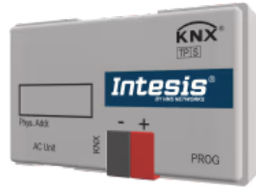
Mitsubishi Electric Domestic to KNX - 1 indoor unit

The Mitsubishi Electric-KNX interface allows full bidirectional communication between Mitsubishi Electric domestic, Mr. Slim, and City Multi air conditioner units and KNX installations. It connects directly to the indoor unit and delivers complete interoperability with KNX.