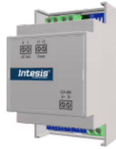
Bosch to Modbus - 1 indoor unit

The Bosch-Modbus interface allows full bidirectional communication between Bosch Commercial and VRF systems and Modbus RTU (RS-485) networks. The interface acts as a server device for the installation, accessing all signals from the air conditioner unit.