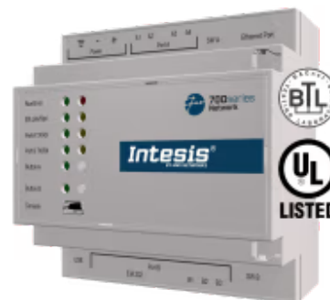
KNX to BACnet/IP & MS/TP - 3000 points

Integrate any KNX device or installation with a BACnet BMS or any BACnet/IP or BACnet MS/TP controller. This integration aims to make KNX communication objects and resources accessible from a BACnet-based control system or device as if they were a part of the BACnet system and vice versa.