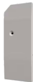
Mitsubishi Electric to Home Automation - 1 indoor unit

The Mitsubishi Electric gateway allows complete and natural integration of Mitsubishi Electric Domestic, Mr. Slim, and City Multi Air Conditioner units into IP-based Home Automation systems. The device connects to the indoor unit through a direct cable and to the Home Automation interface via Wi-Fi.