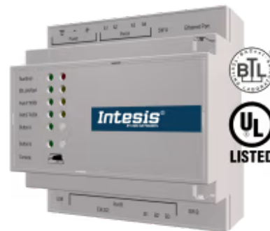
LonWorks TP/FT-10 to BACnet/IP & MS/TP - 600 points

Integrate any LON device or installation with a BACnet BMS or any BACnet/IP or BACnet MS/TP controller. This integration aims to make LON devices, their network variables (SNVT), and resources accessible from a BACnet-based control system or device as if they were a part of the BACnet system and vice versa.