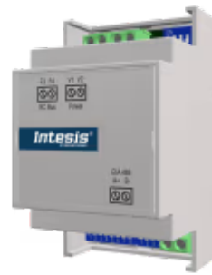
Samsung to Modbus RTU - 1 indoor unit

The Samsung-Modbus interface allows full bidirectional communication between Samsung NON-NASA air conditioner units and Modbus RTU (RS-485) networks. The interface acts as a server device for the installation, accessing all signals from the air conditioner unit. A wired remote controller can also be part of the network.