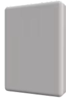
Panasonic to Home Automation - 1 indoor unit

The Panasonic gateway allows complete and natural integration of Panasonic ECOi and PACi Air Conditioner units into IP-based Home Automation Systems. The device connects to the indoor unit through a direct cable and to the Home Automation interface via Wi-Fi. A wired remote controller can also be connected.